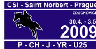
Table: A FEI RG / Art. 238.2.1 Height: 1,00 m